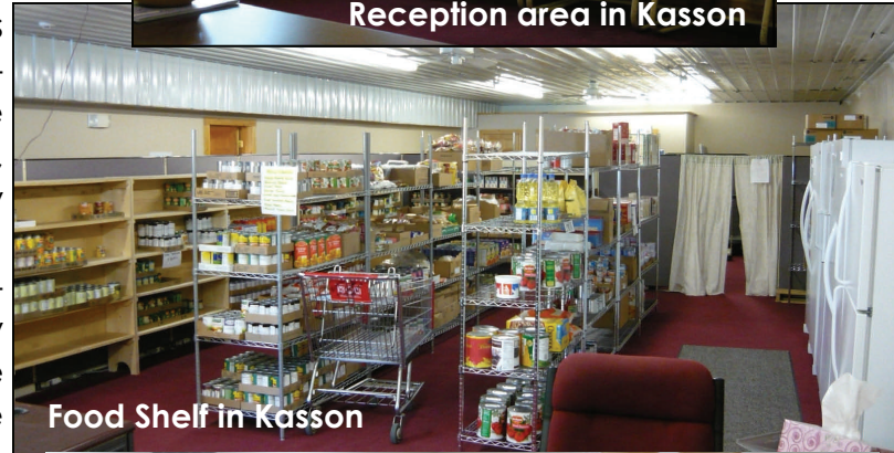
Food Shelf in Kasson