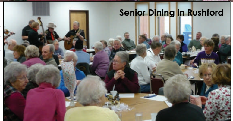
Senior Dining in Rushford

The effects of hunger can range from poor health and slowed recovery from injury or illness to poor performance at school or work. From 2008 to 2009 Minnesota saw a 25 percent increase in food shelf visits—the largest recorded increase in 28 years. Semcac's four food shelves helped 1,110 households with supplemental or emergency food in 2009.