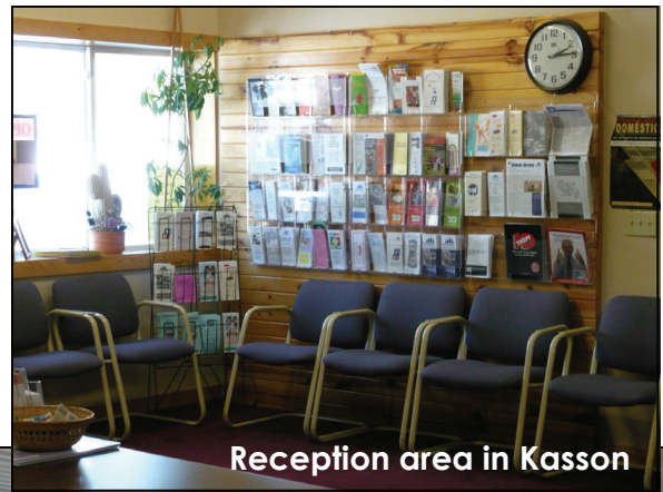
Reception area in Kasson

On January 22, about 100 people attended an open house at Semcac's newly renovated Tenborg Center at 113 E. Jessie Street in Rushford. The building houses the Rushford Food Shelf and a Senior Dining site and kitchen. The Rushford Food Shelf began serving local residents from the Tenborg Center in November. Senior Dining served its first meal there on January 4 and has also resumed preparing meals from the Tenborg kitchen for the Houston and La Crescent Senior Dining sites and local Meals on Wheels deliveries. The Tenborg Center is again a viable space to benefit the community.